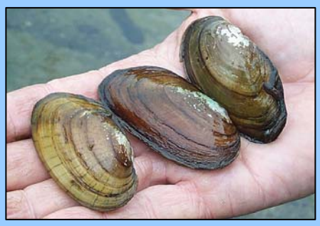
Native clams (Lampsilis radiata, Elliptio complanata, and Pyganodon sp.) extirpated by zebra mussels Bev Wigney