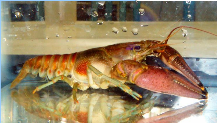
A male rusty crayfish from Wisconsin Brian Roth

Rusty crayfish are native to streams in Ohio, Kentucky, and eastern Indiana (see brown areas on map below). They may have been introduced to Oneida Lake by anglers who used them as bait. Although rusty crayfish were first noted in Oneida Lake in 2005, they were likely present for several years before.