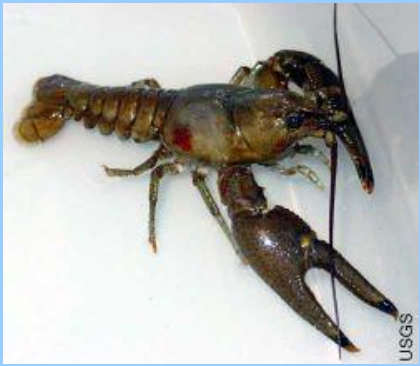
Rusty crayfish USGS