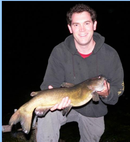
Angling for channel catfish reaps big rewards: