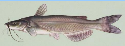
Line drawing showing channel catfish details