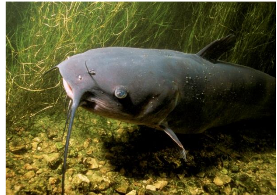
Channel catfish are easily identified by the presence of 4 pairs of barbels.

Channel catfish live in large lakes and rivers, and unlike bullheads, they prefer clear water habitats. In Oneida Lake, they are located in areas with gravel or rock bottoms, and can survive in low oxygen conditions. Channel catfish have an