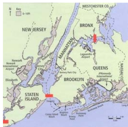
The Stony Brook team's original storm-surge barrier

After running test simulations on past events like tropical storm Floyd and the 1992 nor'easter that flooded New York City, the team confirmed that their system could generate realistic results. So the Stony Brook group began doing some real forecasting, running the model once or twice a day to generate two- to three-sunday forecasts--something that helped predict the impact of Hurricane Sandy, along with models from NOAA and others.