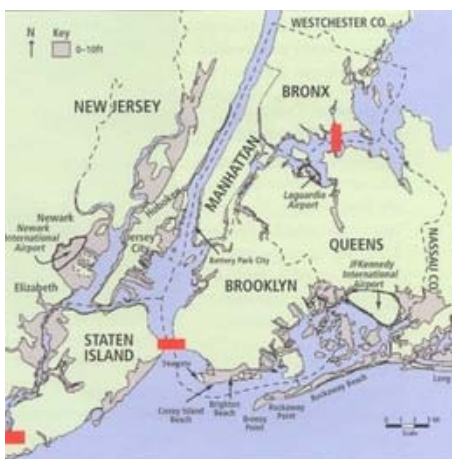
HOW CAN NEW YORK PREPARE FOR THE NEXT HURRICANE SANDY?

It often takes a big storm to get people thinking about how to protect their city from