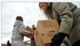
Shelters, other help