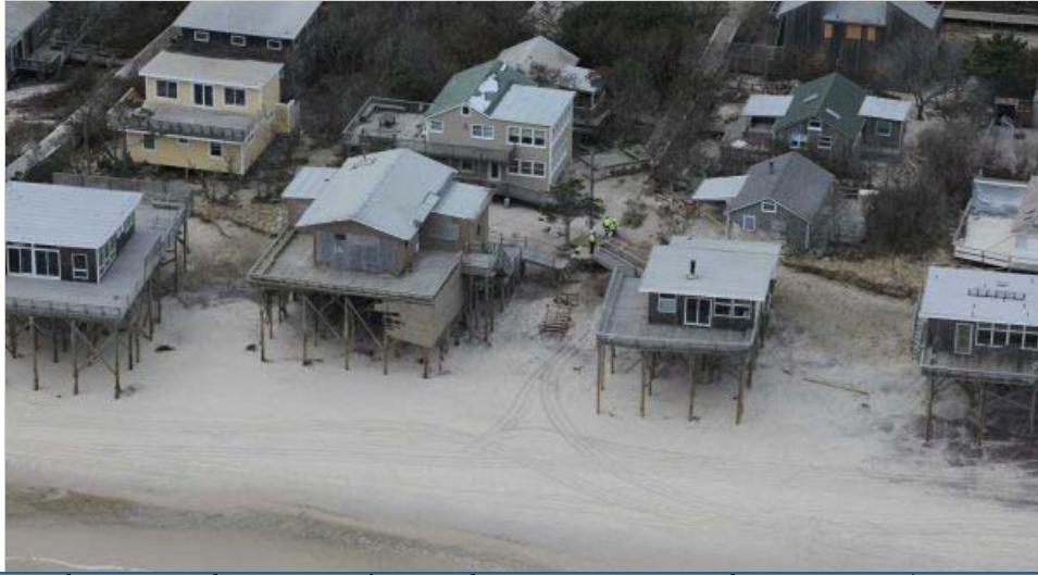
An aerial shot of Fire Island and a look at the destruction caused by superstorm Sandy. (Oct. 31, 2012)