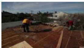
Rebuilding Fire Island