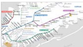
Updated transit maps