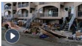
Repairing Long Beach