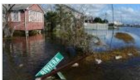
Sandy photos from Mastic Beach