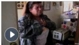
Fixing up hard-hit Lindenhurst