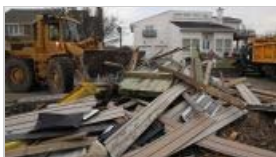
Latest photos: Sandy's impact on Long Island