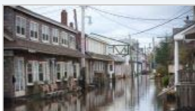
Fire Island Sandy photos