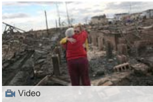
Hurricane Sandy Videos