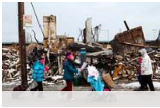
Hurricane Sandy Aftermath