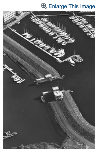
Enlarge This Image

As the storm chugged toward the Eastern Seaboard at 3 p.m. on Oct. 27, an engineering crew in Stamford, Conn., was at the ready. It was time.