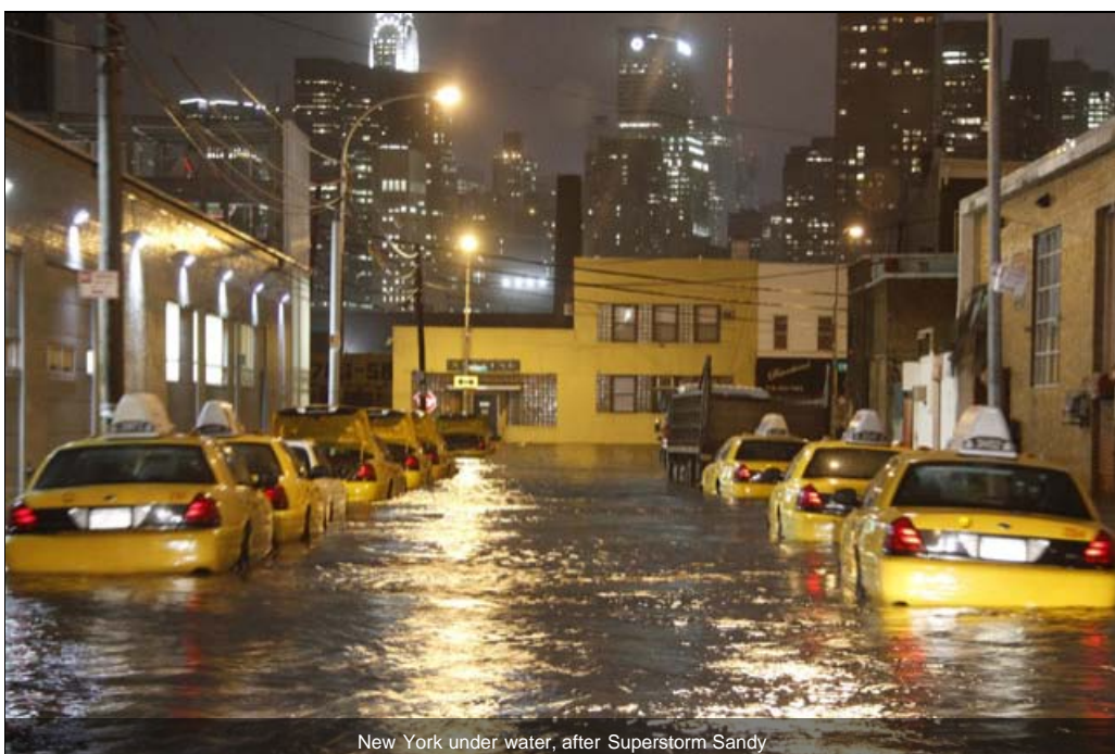
New York under water, after Superstorm Sandy

Top US civil engineers warned of the dangers to New York City from a huge storm-surge at a conference in 2009, only to have their recommendations for Thames-style tidal barriers largely ignored.