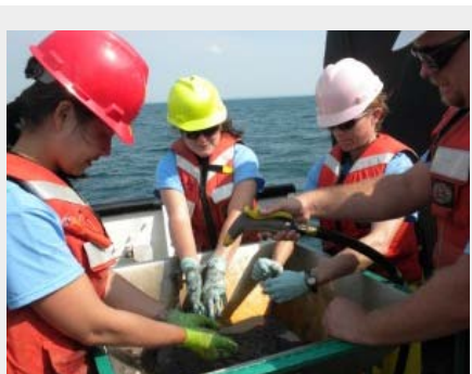
Teachers check mud samples from Lake Ontario. They extracted these samples from more than 16 stations in the last few days alone.

PONAR takes a small scooper and drops it to the bottom of the lake to take samples.