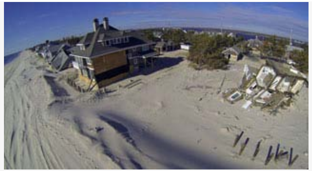
Damage to homes along the beach in Mantoloking, New Jersey, left by Hurricane Sandy five months after the storm. Taken from a miniature Quadcopter along the coast of Mantoloking.