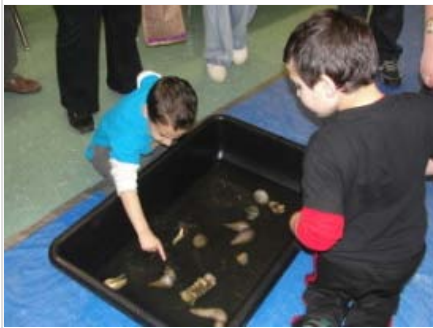
Children are amazed by live starfish, sea cucumbers and other marine life