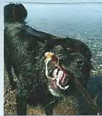
Dogs like Robert love to frolic in water, but may be at health risk from algal toxins. Sadly, the number of dog poisonings from these toxins is on the rise.