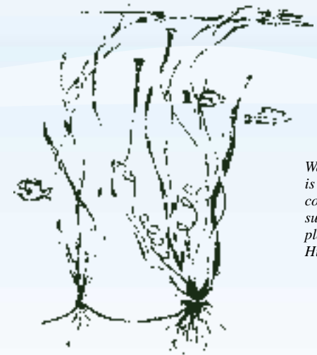
Water celery is the most common submerged plant in the Hudson River