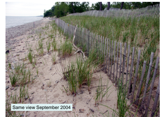
Same view September 2004