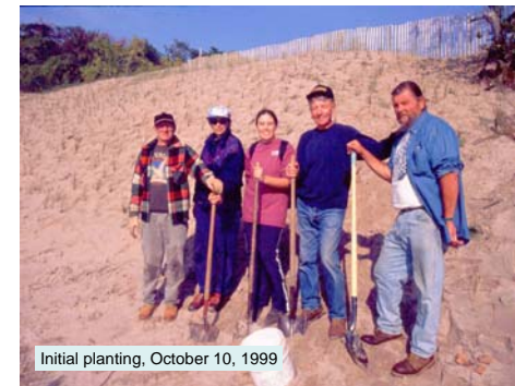
Initial planting, October 10, 1999