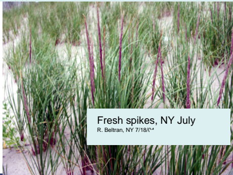
Fresh spikes, NY July