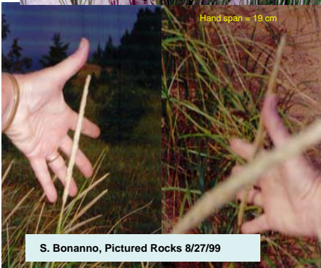
S. Bonanno, Pictured Rocks 8/27/99