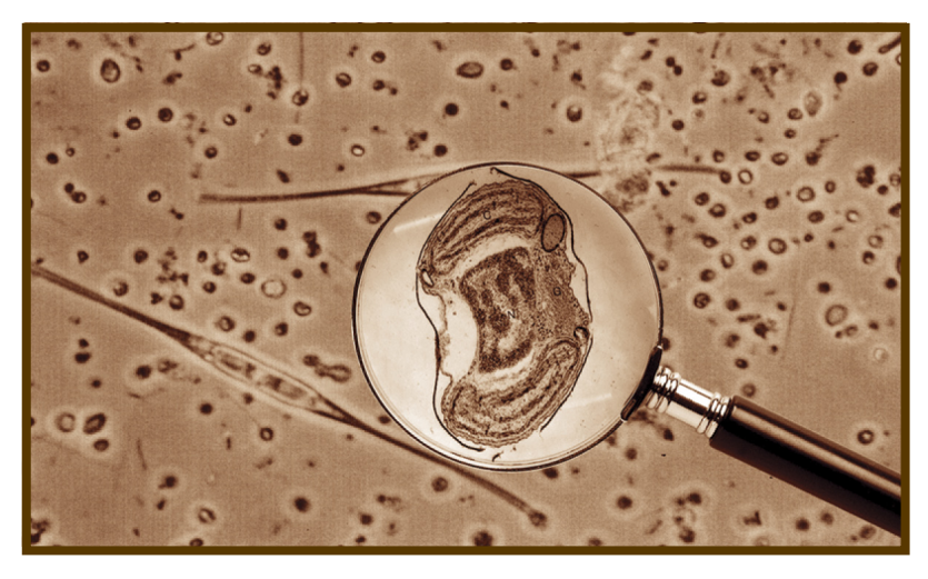
Figure 1 : Under high magnification is an Aureococcus anophagefferens cell with a distinct cell wall. The photomicrograph shows a phytoplankton assemblage that includes the circular brown tide cells and elongated diatoms.

If A. anophagefferens is to bloom and dominate the phytoplankton community, its net population growth must be higher than that of the competing phytoplankton species. The net population growth is determined by how fast the A. anophagefferens cells multiply (that is, their growth rate) and how fast they disappear from either grazing or death and decay. In Long Island bays, A. anophagefferens can double its population in 12 hours. The fact that there have been brown tides indicates that A. anophagefferens's growth can keep pace with or even exceed the growth of many co-occurring algae.