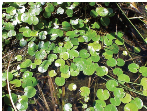
European Frog-Bit in Lake Champlain Mark Malchoff, LCSGP

European frog-bit, Hydrocharis morsus-ranae , is an annual herbaceous aquatic plant (that is, it germinates, grows, flowers and dies in the space of one year). European frog-bit is free-floating (it has no roots attached to the bed of the water body), but in situations where the vegetation is dense enough, the leaves may become emergent. European frog-bit greatly resembles miniature water lilies. The plant looks similar to American frog-bit ( Limnobium spongia ). It has been found in the Great Lakes Basin since the 1930s, but is now spreading into inland streams and lakes within the Basin. It is considered invasive as it can displace native flora, possibly resulting in habitat impacts on native fauna.