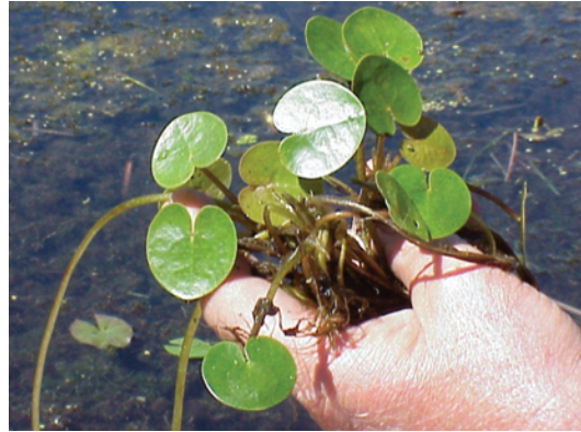
European Frog-Bit in Lake Champlain Mark Malchoff, LCSGP

community diversity may also affect native aquatic fauna. In autumn, as the mats decompose and settle to the bottom of the waterbody, dissolved oxygen levels can be dramatically decreased, resulting in the death of fish and native vegetation. Dense mats of European frog-bit can also inhibit movement of waterfowl, large fish and boats, and limit recreational activities such as swimming. On the other hand, European frog-bit can serve as a food plant for some types of water birds, some fish and insects.