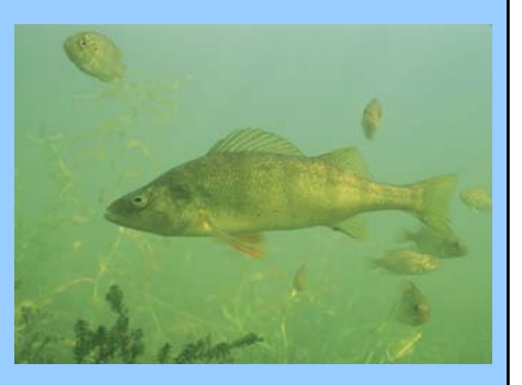
A yellow perch in its natural environment