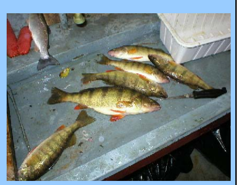
Yellow perch may be caught year round on Oneida Lake