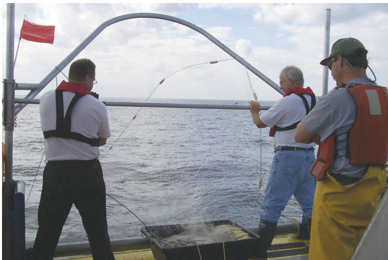
USGS biologists aboard the R/V Kaho set gillnets to gather lake trout.