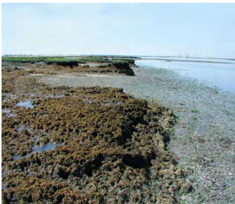
Black Bank Marsh in Jamaica Bay is an example of a deteriorating marsh that shows erosion down to the underlying mineral sediment (gray area) and marsh peat (foreground).