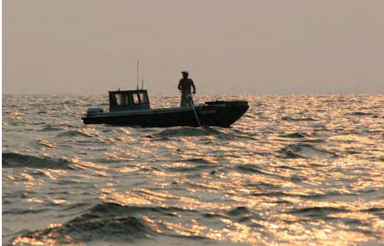
At dawn a lone clammer gets an early start on Great South Bay, Long Island. This relatively shallow body of water, ringed by wetlands, is the site of ongoing efforts to restore the once bountiful hard clam industry.