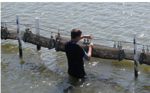
Sea Grant and many others associated with the aquaculture industry are working to advance methods of off-bottom oyster farming.

Louisiana Sea Grant’s Law and Policy Program worked with the Louisiana Department of Wildlife and Fisheries to develop the legal framework for Alternative Oyster Culture (AOC) permitting, removing a major barrier for oyster growers in Louisiana. As a result of the effort, the first three AOC permits have been issued as of late 2017. Coastal land loss and sea level rise have contributed to a nearly 80 percent loss of oyster resources in Louisiana over the past 10 years, creating a severe hardship in coastal communities where oyster production is a critical stimulus to the local economy. AOC involves growing oysters in suspended cages and not on the water bottom, drastically improving an oyster growers’ harvest.