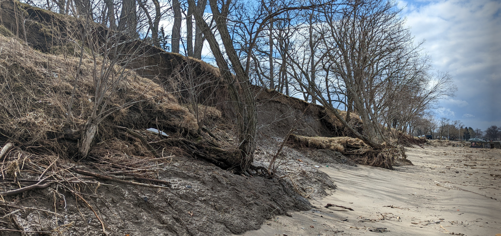
Figure 2. Oversaturated soils from intense rainfall or overwatering of lawns can cause soil to move away from and off of steep bluff faces in mass movements, sometimes as soil creep or earthflow (as seen above) but other times in small to large landslides (see insert.)