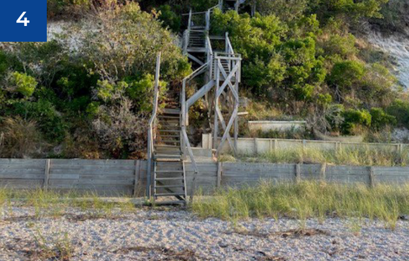
Figure 4. A vegetated bluff on Long Island.