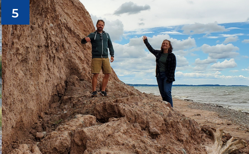
Figure 5. Toe erosion and slumping on the shore of Lake Ontario.