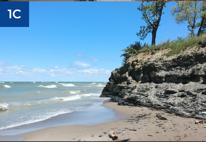
Figure 1. Many types of bluffs, in various shapes, sizes, and compositions, exist in New York State. They include but are not limited to rapidly-eroding glacial lake sands in Wayne County (1A), unconsolidated sediments ranging in grain sizes in the bluffs of Long Island (1B), and bedrock bluffs in Angola on Lake Erie (1C) which are topped with glacial lake sand and gravel.