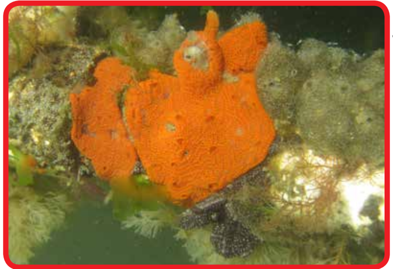
Sea squirts account for all of the organisms in the photograph, except the branching material and the green plants. At least four different species are visible.