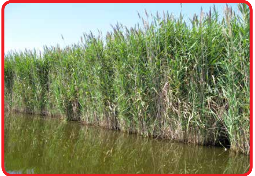
Invasive Phragmites has spread widely across the US and can be found in many areas, including this site at Sunken Meadow State Park in Kings Park, NY.