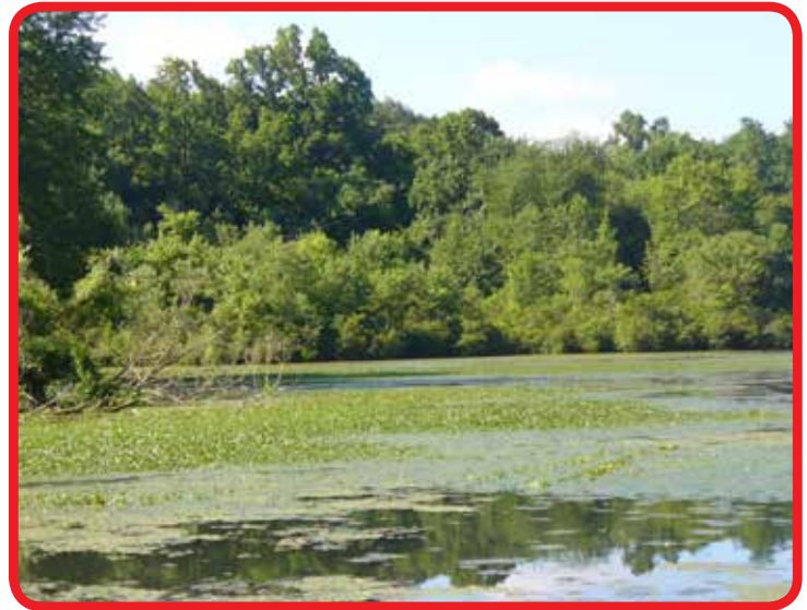
Water chestnut was first discovered in Mill Pond in Oyster Bay, NY in 2005 and has since been almost entirely removed.