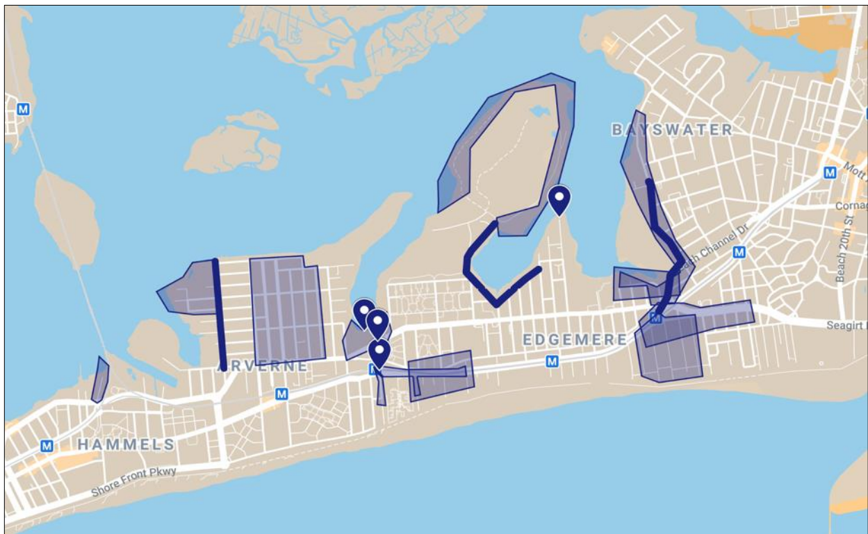
Map 3: Rockaway Flooding Observations