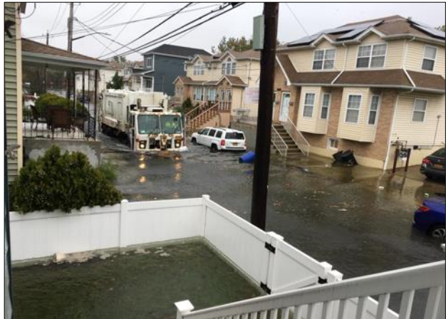
First Street in Hamilton Beach, Queens NY 11414