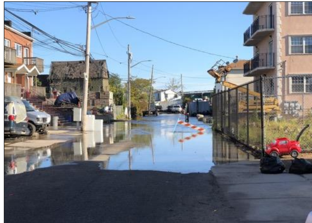
Beach 84 th Street in Rockaway Queens, NY 11693