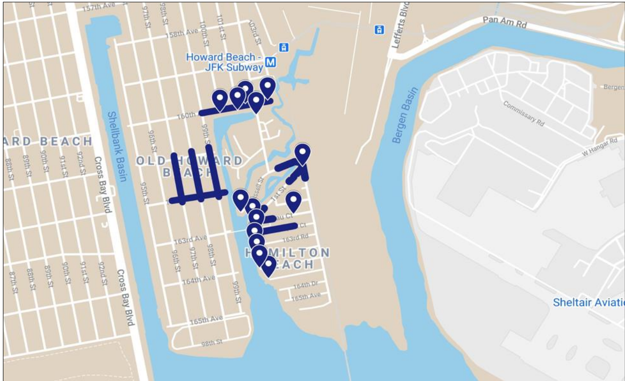
Map 2: Howard Beach/ Hamilton Beach Flooding Observations