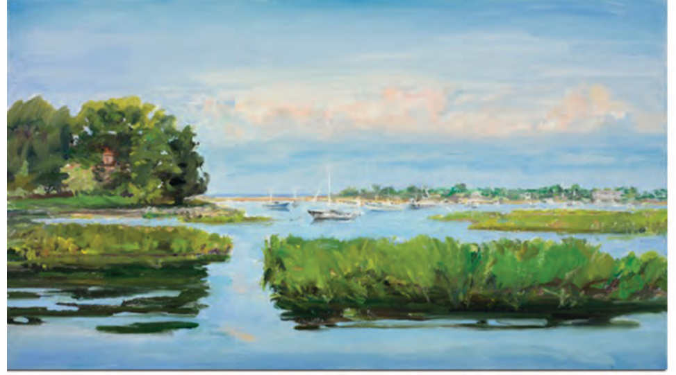
Mount Sinai Harbor on Long Island's north shore, one of 50 Long Island Sound embayments being studied for the risk of eutrophication in a newly-funded research project. Oil painting and photo by Joan Branca