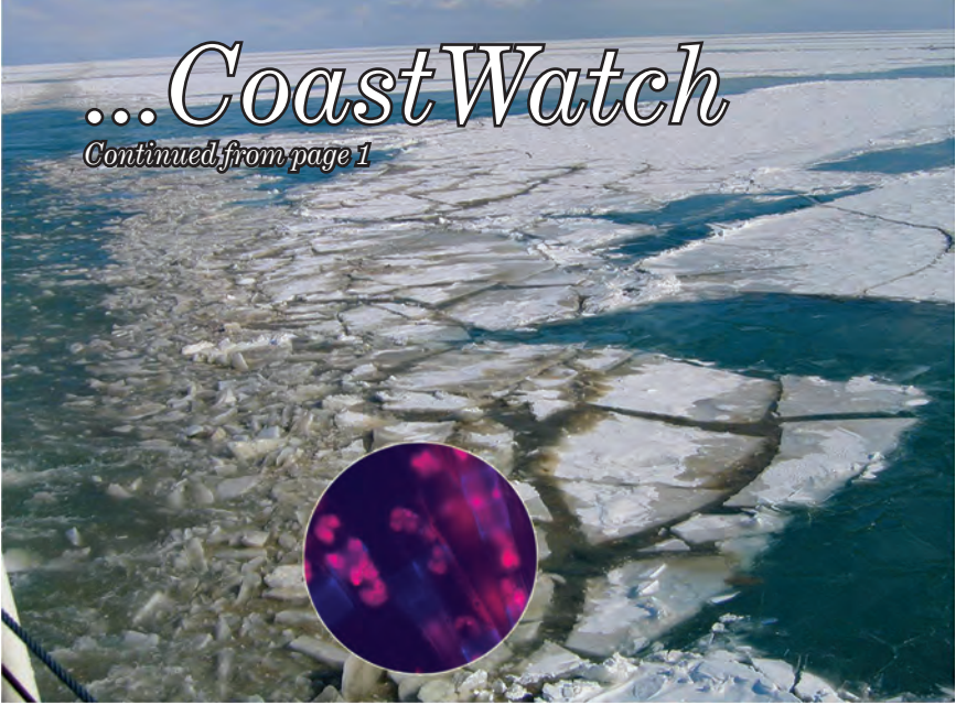
Productivity in Lake Erie is greater in winter than in summer. The Coast Guard cutter reveals streaks of brownish silt containing filamentous diatoms as it cuts through lake ice. Microscopic inset: Fluorescence is used to show the silica structure within filamentous diatoms.