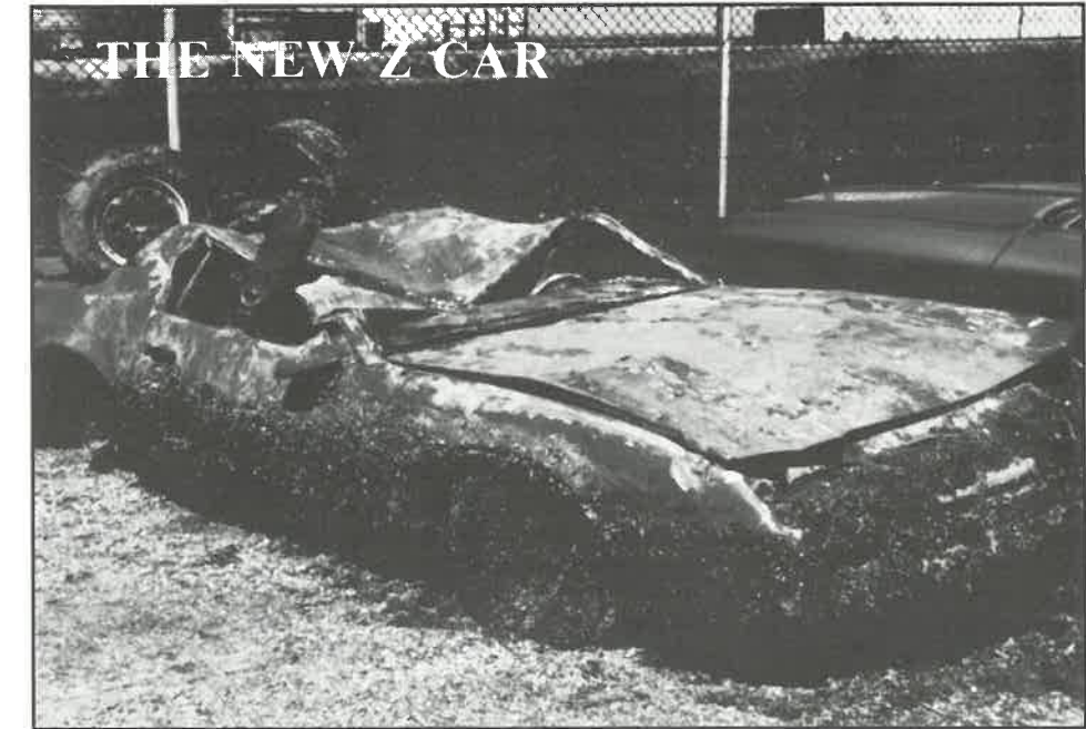
Zebra mussels by the thousands out for a joyride decide to take up housekeeping in this car recently fished out of Lake Erie.

According to researchers in Lake Erie, there are portions of the lake with zebra mussel densities exceeding 30,000 to 40,000 mussels per square meter. With the large removal of algae from the lake's food web and heavy mussel colonization on the lake bottom