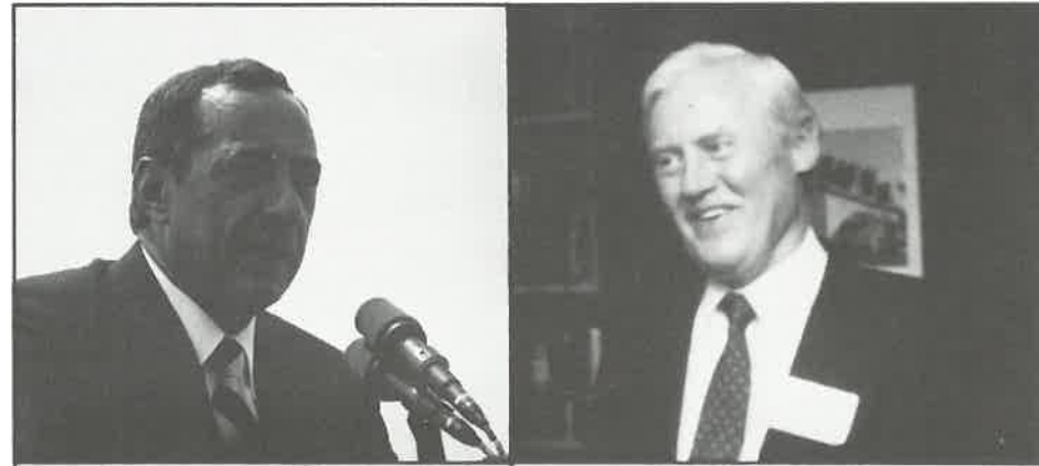
TOP LEFT: Mario Cuomo, New York state governor, signed four bills to protect the state's coastal environment.

A state water pollution control revolving fund that will provide more than $4 billion in low-interest loans through the end of the century to assist localities in improving and upgrading sewage treatment facilities.