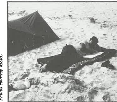
A rough day at the office.