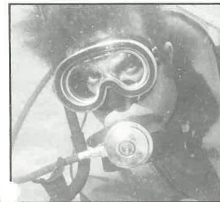
The Algae Man—our man down under.