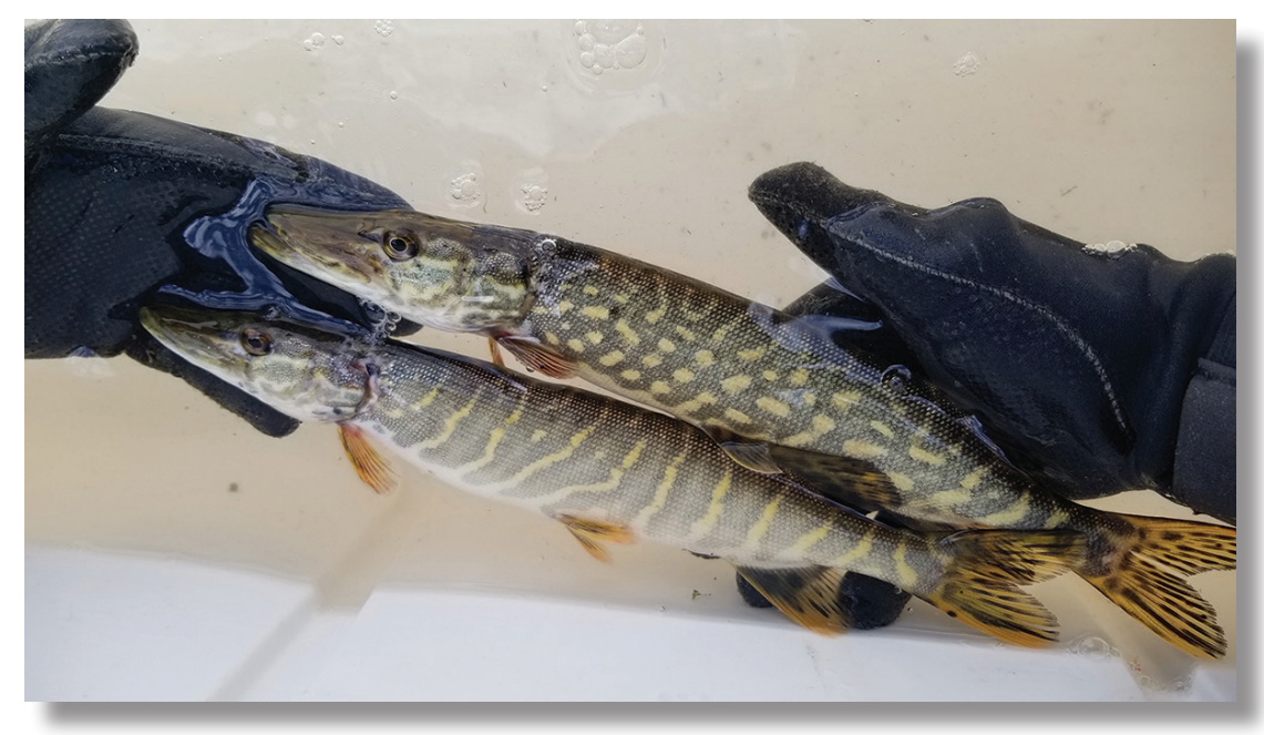
SUNY ESF investigators are examining how Northern pike, like these from the St. Lawrence River, are impacted by the dominance of invasive plants under similar water level regulation and climatic conditions.

Research Program Coordinator email: lane.smith@stonybrook.edu