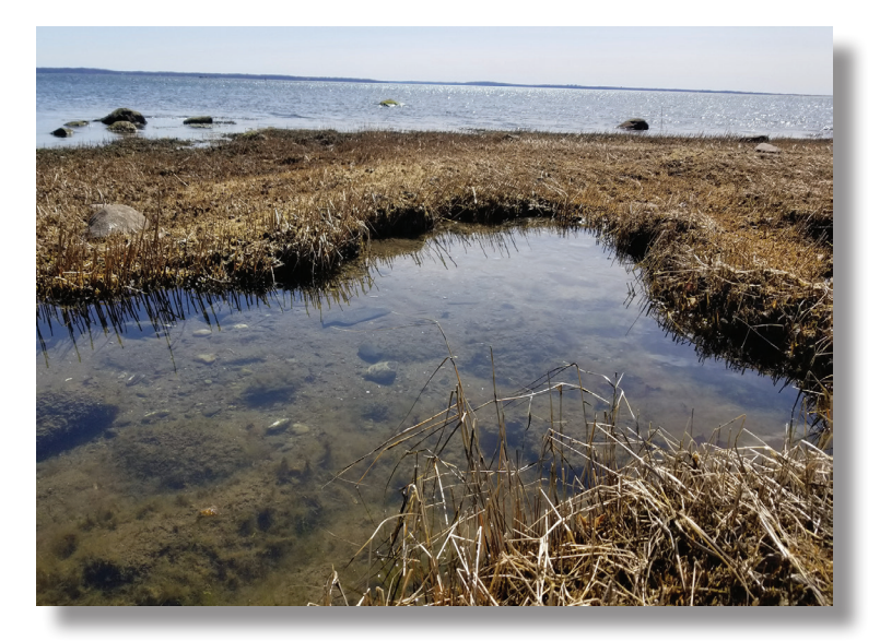
Investigators at SBU will examine hypoxic (low dissolved oxygen) conditions in locations along Long Island Sound's western basin, where they most commonly occur. These early spring tide pools pictured here along the coast of Long Island Sound's western basin are located at the Edith Read Wildlife Sanctuary in Rye, NY.