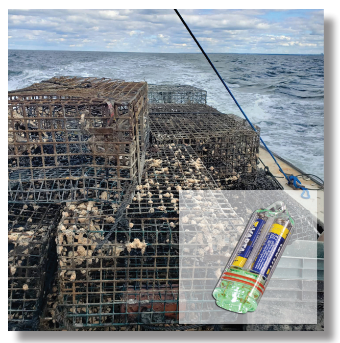
A Cornell Cooperative Extension of Suffolk County (CCE Suffolk) project will examine the effect of LEDs (Light Emitting Diodes) in pots of New York crustacean fisheries. In the past, Jonah crabs were an unintentional catch in the lobster harvester's trap. More recently, the crabs are viewed as a target species. Commercial fish harvesters have increasingly been shifting their target species from lobster to Jonah crab due to changing species populations. Image credit: CCE Suffolk; Inset: PotLights , a product for the crab and lobster fishing industry, are LED lights designed to increase catch rates while reducing or eliminating the need for natural baits. Image credit: PotLights

Successful results will economically benefit the fishing industry by reducing costs and have a positive environmental impact on bait species. CCE will include an outreach and education component to disseminate the results to relevant stakeholders.