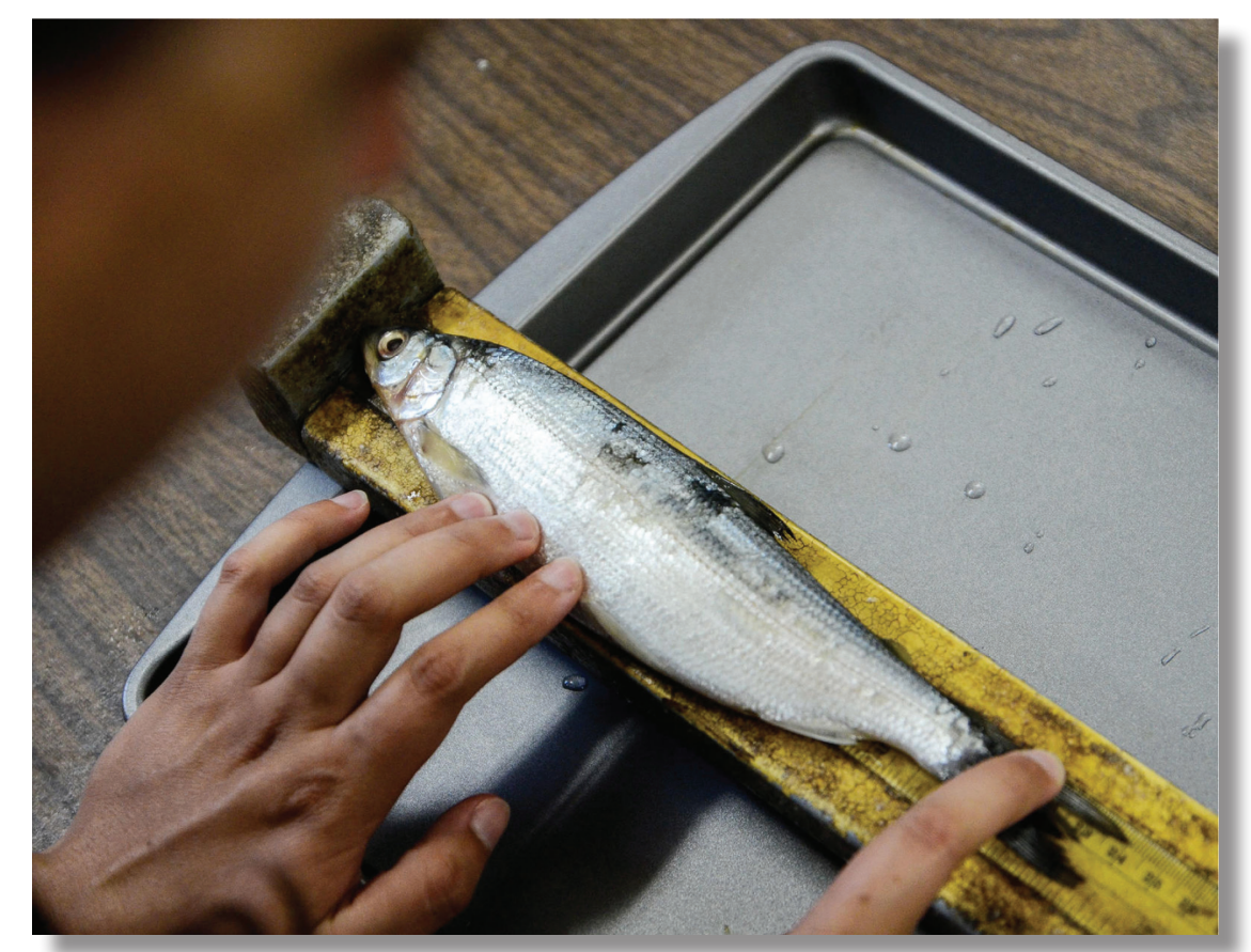
Cisco, the focus of a Cornell University-led project, was once a commercially and ecologically important fish in Lake Ontario. The study described the genetic diversity of cisco populations to inform restoration efforts.