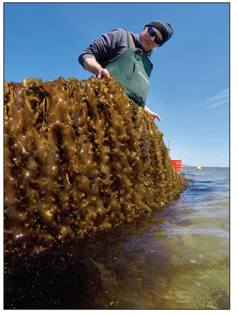
Sugar kelp, a brown rubbery plant that can grow underwater fronds 15 feet long, have been shown to help control a variety of HABs. NYSG-supported researchers have developed and are testing shellfish aquaculture techniques that integrate macroalgae culture.