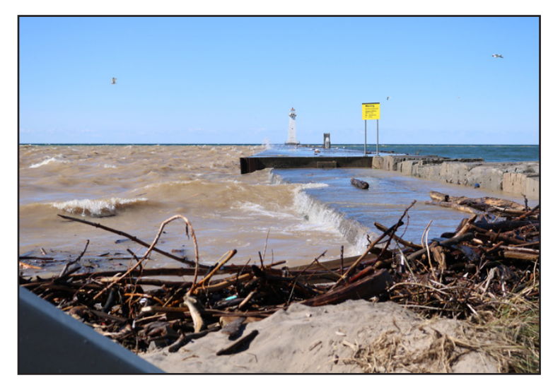
Unprecedented high water levels and record flooding in 2017 and 2019 was a challenge for coastal communities along Lake Ontario. NYSG-funded research has provided information that will help communities apply for assistance through The New York Climate Smart Communities Program.