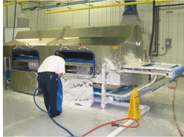
Back to Basics: A new 12-module Internet course, available from NYSG on demand at low cost, helps businesses train employees in basic food safety concepts and Good Manufacturing Practices.

A new Internet course on basic GMPs - Good Manufacturing Practices - the conditions and practices denoted in federal and state regulations as necessary to produce