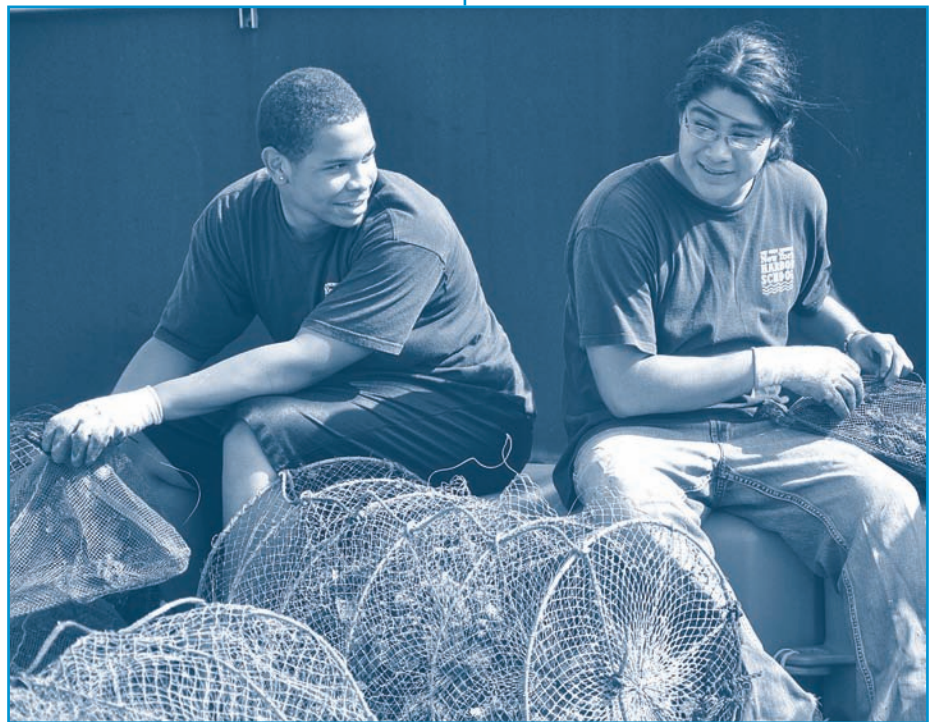
Students work with oysters as a part of the Adeona service day. Students participating in Harbor Corps (a weekend program for students) taught volunteers from Adeona Foundation about the oyster projects that Harbor School students are involved in. On this particular day, students and volunteers were transferring oysters from one net to another.