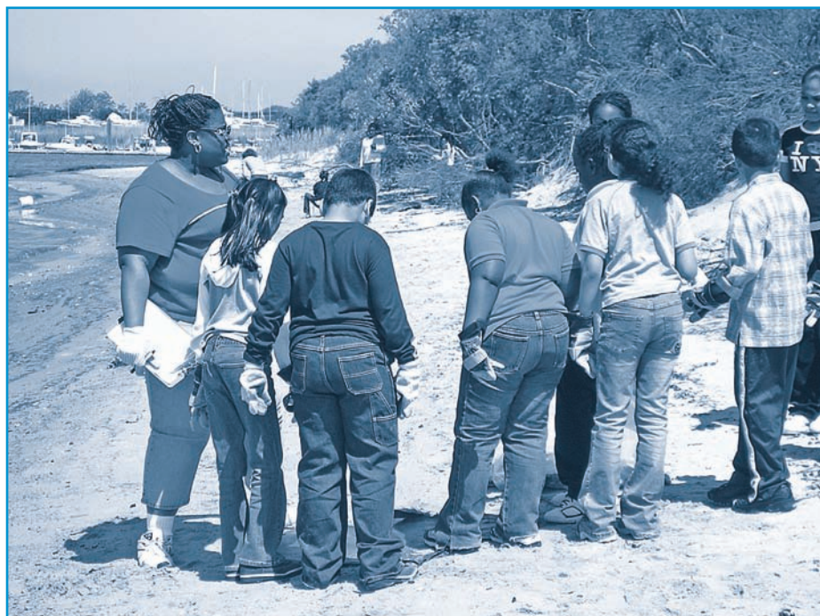
Being outdoors and engaging in a meaningful activity are important in instilling a sense of responsibility as stewards of the Harbor. Children learn the connection between their lives and the Harbor.