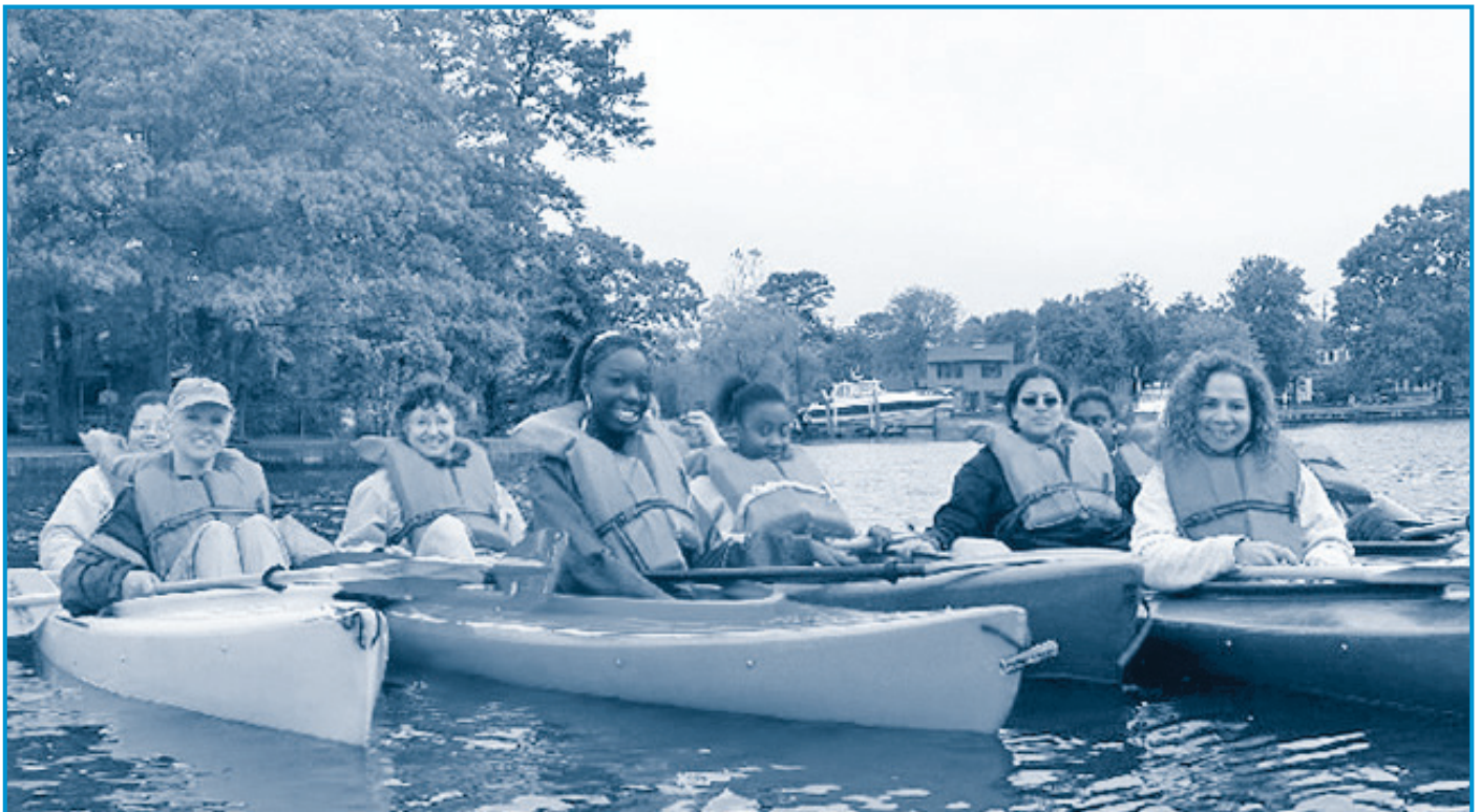
High School students are introduced to kayaking at one of NYSMEA’s conferences at Dowling College.