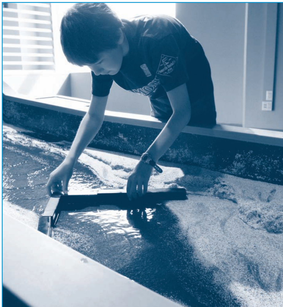
Guests take control of the water and sediment in a 20-foot long model of the Hudson River! Control “rainfall” in the mountains, create dams and levees, and learn more about how sedimentation, erosion and pollution control work.