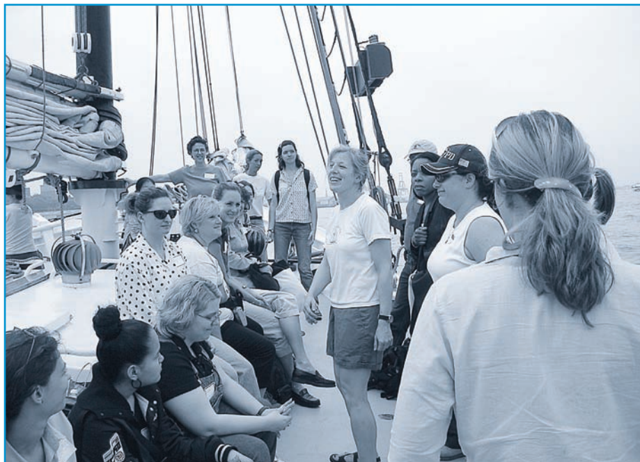
Training and empowering teachers is one of the most important steps in ensuring that our children have a meaningful experience in the Harbor. A sail on the Seaport Museum's Pioneer shows teachers how the harbor fits into many disciplines they need to teach, not just science or social studies.

In dealing with the creation of the Harbor Literacy Points, and at various Task Force meetings, there was always a discussion of barriers—barriers to getting kids outside, to getting kids on (even near ) the water, and getting teachers to adopt the points in their curriculum. While barriers are different across the boroughs of New York City and New Jersey municipalities, the main ones include lack of transportation (whether it's money to pay for busses or even time to get somewhere near the water); lack of administrative support from principals or school districts; and lack of understanding about liability