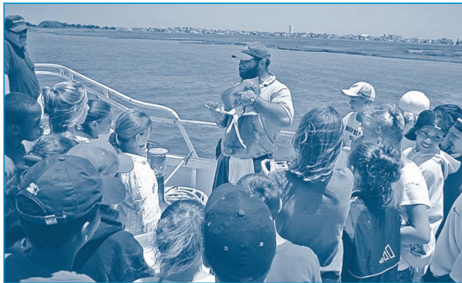
A Wetlands Institute naturalist shows off a skate that was pulled up in the trawl.

Ask most kids what they'll find at the Jersey shore, and those are the answers you're likely to get. In our rush to leave no child behind, we've left a sense of place behind. Children may learn about the rainforest, but know nothing about what's in the water right around them.