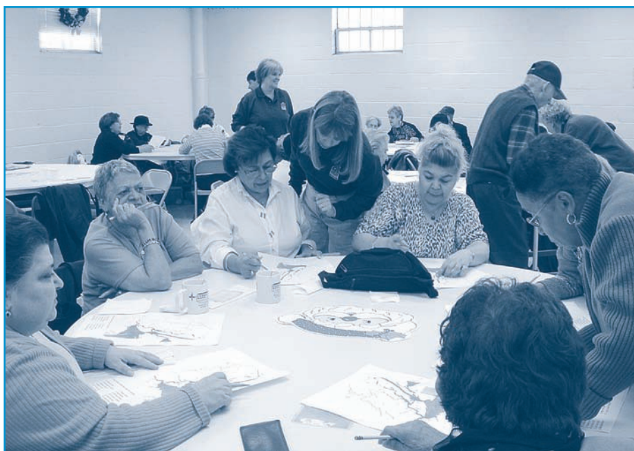
Older adults at the Hackensack Senior Center learn about the ecology and history of the Meadowlands.