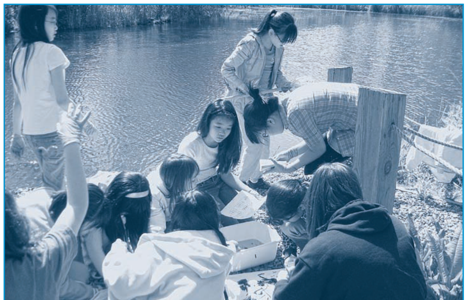
Fifth grade students from PS205Q in Bayside Queens, conducting a pond invertebrate survey at the Windmill Pond in Alley Pond Park, as part of a GLOBE research project.