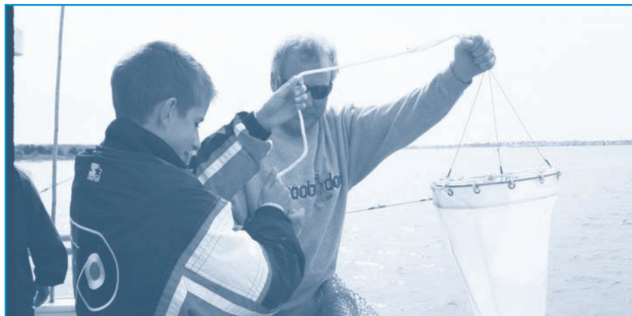
A student and teacher prepare to let out the plankton net.