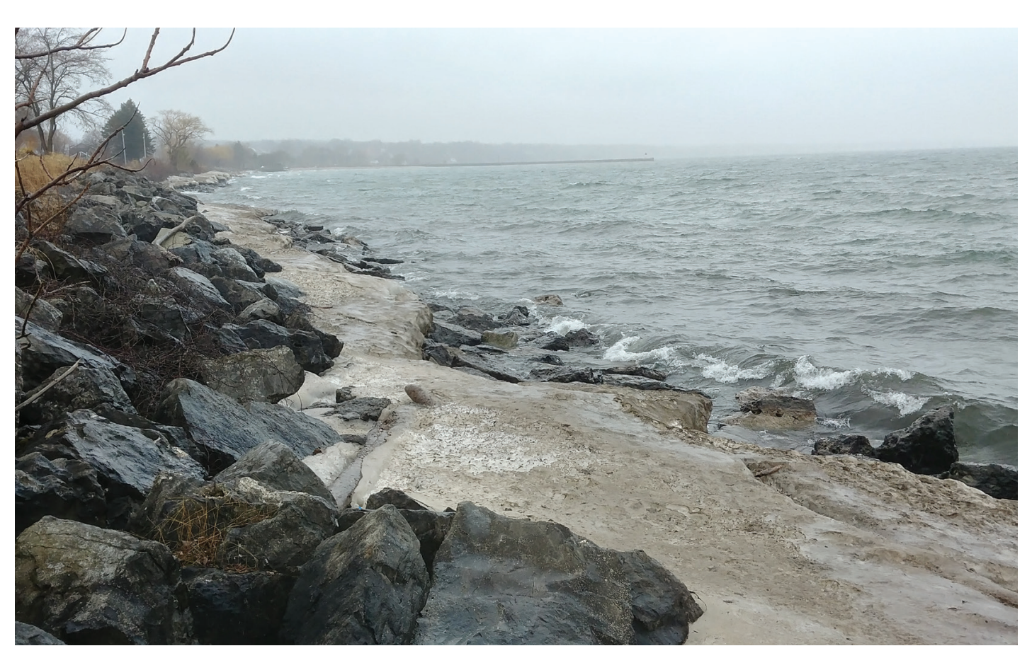
Ice-covered rock rip-rap revetment, Irondequoit Bay (Monroe County, NY).

Hard structures generally impede important coastal processes such as littoral drift of sediments and can compound impacts from intense wave energy, resulting in significant erosion to neighboring shorelines. Gray shoreline structures may also deplete sensitive coastal ecosystems and disrupt habitat connectivity.