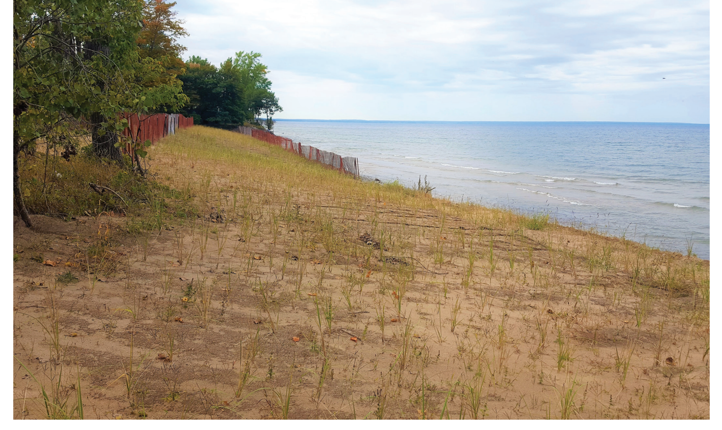
Ongoing dune revegetation and sand fencing placed at Sandy Island Beach State Park.