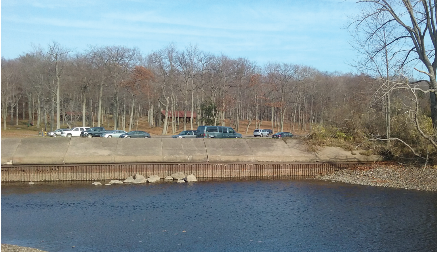
Concrete and steel sheet pile seawall protecting a small harbor, Selkirk Shores State Park (Jefferson County, NY).