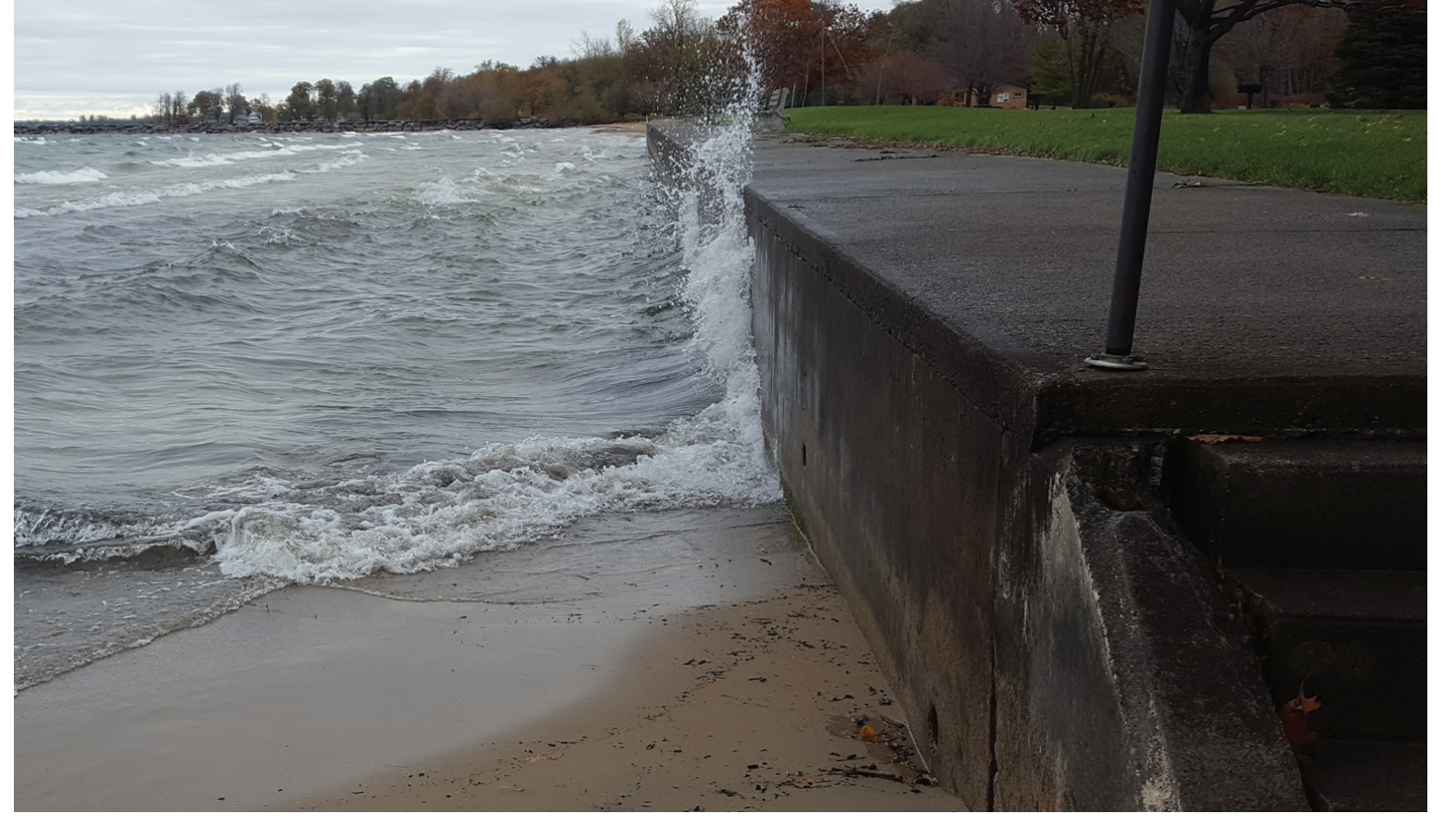
Concrete bulkhead deflecting waves, Westcott Beach State Park.

Cast-in-Place Concrete: This type of bulkhead resembles a concrete seawall except that it is smaller in size. Like a sheet pile bulkhead, this bulkhead relies upon anchoring to retain its vertical position and to resist wave action.