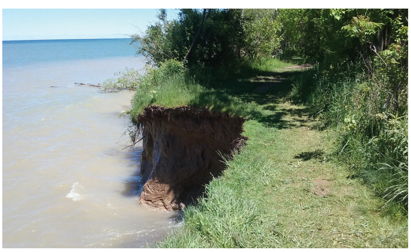
Bluff erosion at Chimney Bluffs State Park.

The stability of coastal bluffs along New York's Great Lakes depends on the action of the surface water over the face of the bluff as much as it does on the material of the bluff, steepness of the slope and wave action at the toe of the slope. Human disturbances on the bluff may also affect stability.