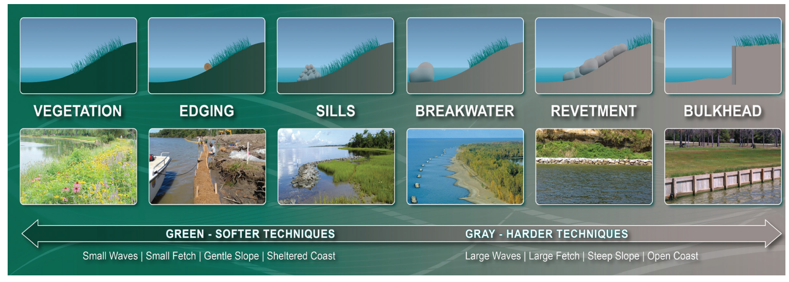
Green to gray shoreline options. Produced by Joe Ruszala, United States Army Corps of Engineers.

Surface erosion can be minimized by collecting and diverting runoff from the face of the slope, by minimizing hard-surfaced areas, which tend to shed rainwater more rapidly than natural ground surfaces, and by proper use of vegetation to slow runoff.