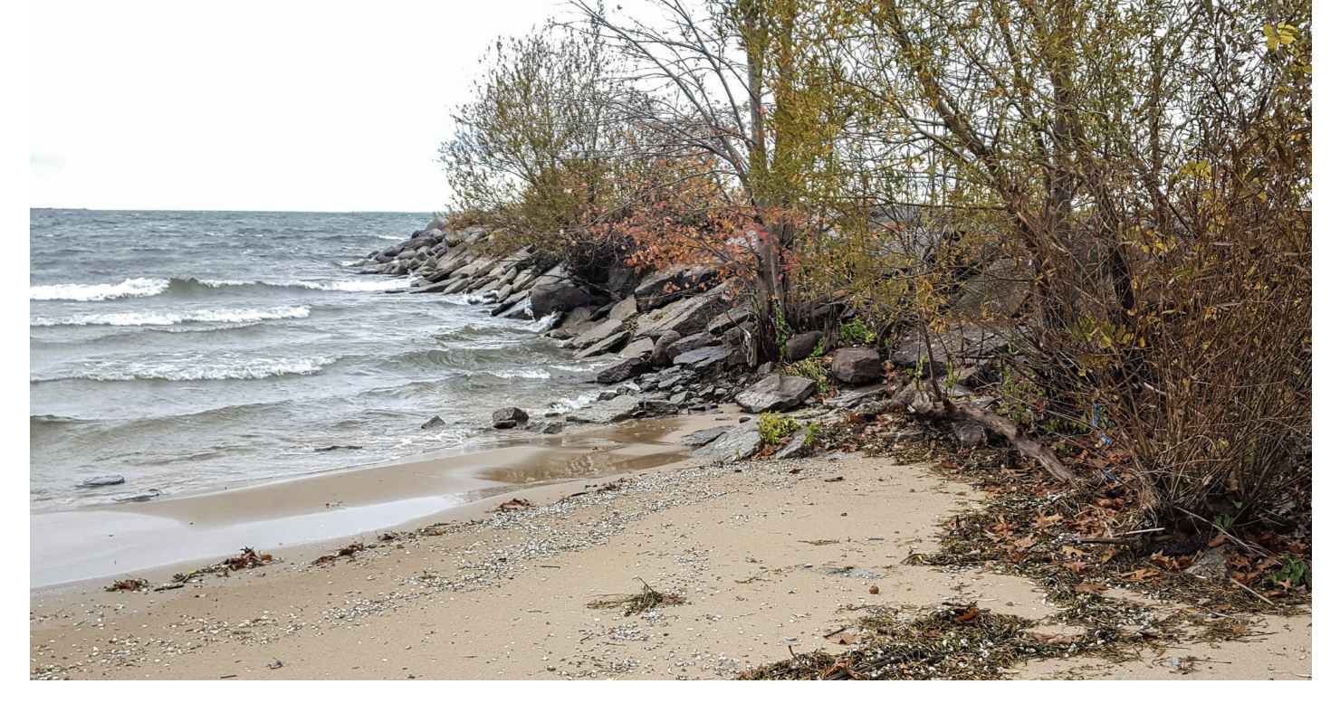
Small rubble mound groin with vegetation, Westcott Beach State Park.