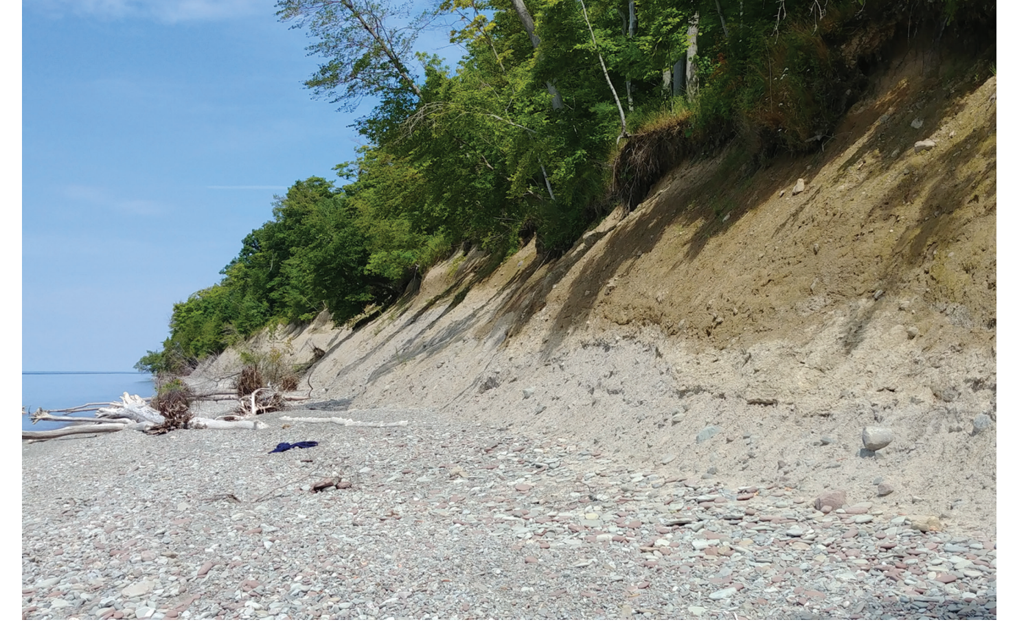
An eroded bluff composed of glacial outwash and till, Sterling, New York.