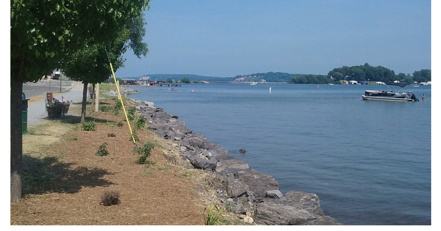
Nature-based shoreline employed at Sodus Bay (Wayne County, NY).