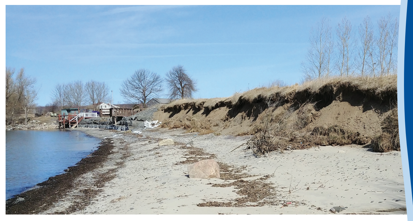
Mixture of shoreline management options on Chaumont Bay, NY.

Great Lakes Coastal Processes and Hazards Specialist