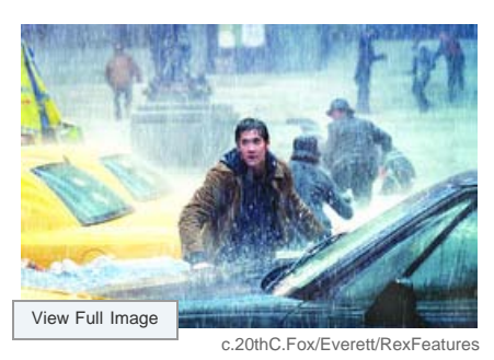
A scene from blockbuster disaster movie "The Day After Tomorrow", in which a huge wave engulfs New York

2100," he says. In contrast, the Netherlands and Thames Estuary have recently launched plans for tackling climate change that look forward at least 100 years.