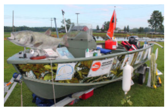
One of the 2013 Discover Clean and Safe Boating vessels was this fishing boat

To reach large numbers of people throughout the state, NYSG created an award-winning "Discover Clean & Safe Boat" display, using different styles of vessels provided each year by NY-based boat manufacturers. The boats are equipped with the required and recommended safe and clean marine equipment for boating on NY waters. Stop Aquatic Hitchhikers "Clean-Drain-Dry" materials, informational pamphlets, watch cards and preserved AIS specimens (e.g., Asian Carp, Sea Lamprey) help the public learn about invasive species and steps they can take to reduce their spread. In 2013, the display was stationed at 13 events, located along Lake Erie and Lake Ontario, the Fingers Lakes,