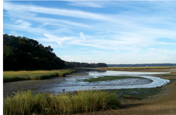
Municipal Stormwater Programs protect Long Island's estuaries (Stony Brook Harbor).

NYSG NEMO assisted east end municipalities in planning their stormwater programs, and in establishing measurable goals for public education, illicit discharge detection, construction oversight, and pollution prevention programs.